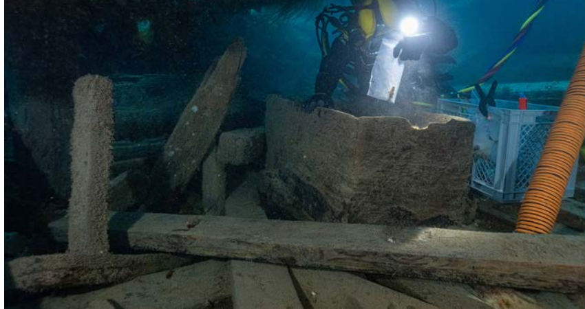
Bernier holds a recovered medicinal vial in an artifact bag while excavating a seaman's chest on the lower deck of HMS Erebus on Sept. 14, 2023.